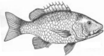
American Red Snapper